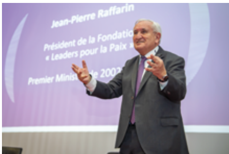
Jean-Pierre RAFFARIN President of the Leaders pour la Paix Foundation and Prime Minister of France from 2002 to 2005

This year, NEOMA has resumed its tradition of hosting top executives on its campuses. These exceptional gatherings are an opportunity for students to be made aware of the future responsibilities that will soon be theirs and to discuss with great business leaders.