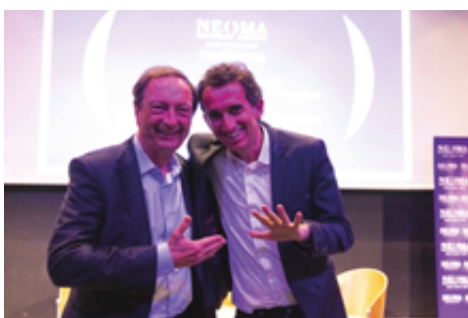
Alexandre BOMPARD President-CEO Carrefour